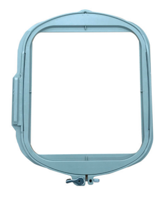
Included 10 5/8" x 10 5/8" Large Embroidery Hoop

With included tools to help inspire your innovative projects