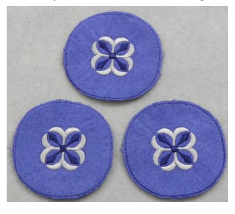
Apply interfacing and stabilizer as necessary and embroider button designs.

When finished, remove excess stabilizer and cut out button cover just outside the circular stitching line. Lightly press each piece.