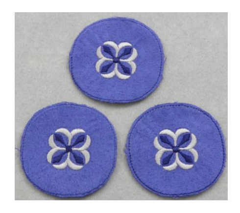
Apply interfacing and stabilizer as necessary and embroider button designs.

When finished, remove excess stabilizer and cut out button cover just outside the circular stitching line. Lightly press each piece.